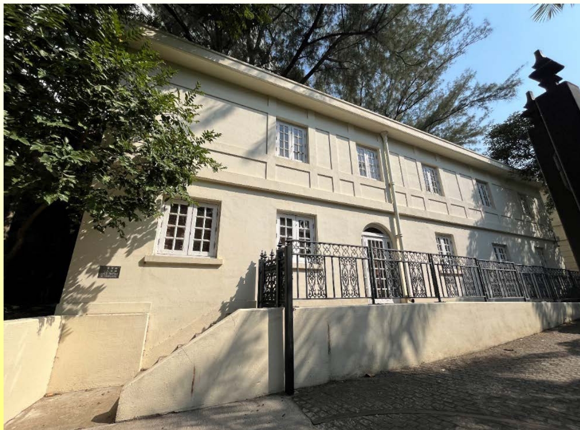
正立面 Front elevation