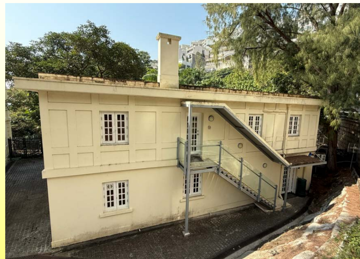
背立面 Rear elevation